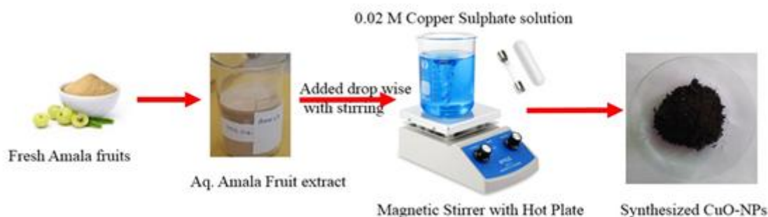
Figure 1: CuO-NPs synthesis from copper sulphate solution and amala fruit extract

After structural validation by various analytical techniques, the synthesized nanoparticles then tested for their catalytic applications. Schematic presentation of synthesis of CuO-NPs shown as in figure 1.